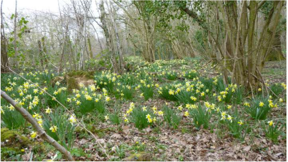
Daffodils on one of the walks