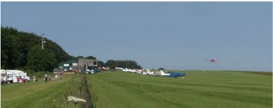
The meet at Compton Abbas airfield. How close to the action can you get?