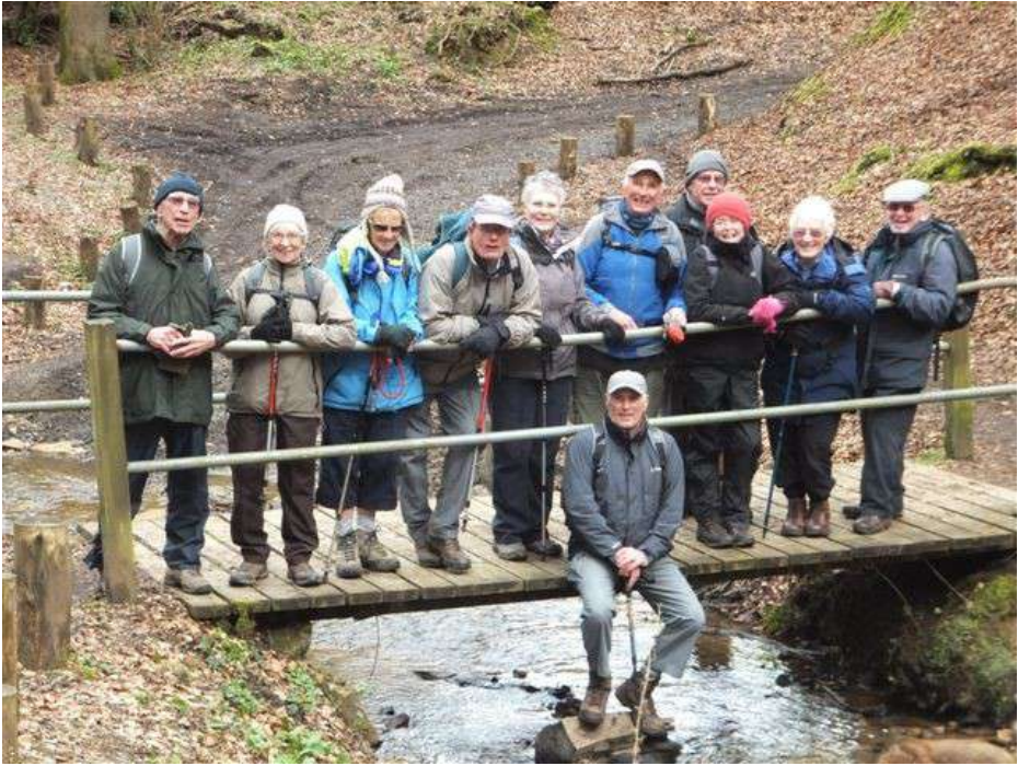
The Wessex Winter Walkers. Thankfully we don't have to dress like this at the moment.