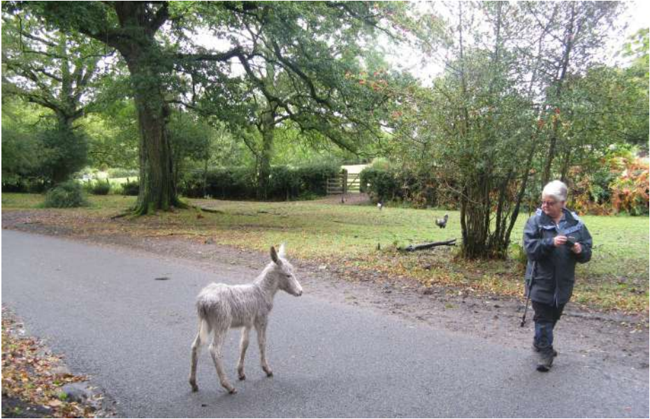
Aren't you a bit young to be out without Mum?