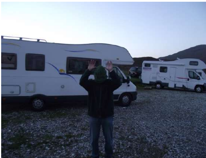
Bog Monster? No; Peakland member finding midges challenging on Skye