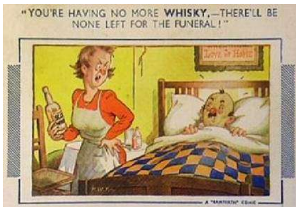
Donald McGill saucy seaside postcards

If we have whet your appetite make a note of the dates in your 2015 diary and come and enjoy some good walking in beautiful Yorkshire countryside.