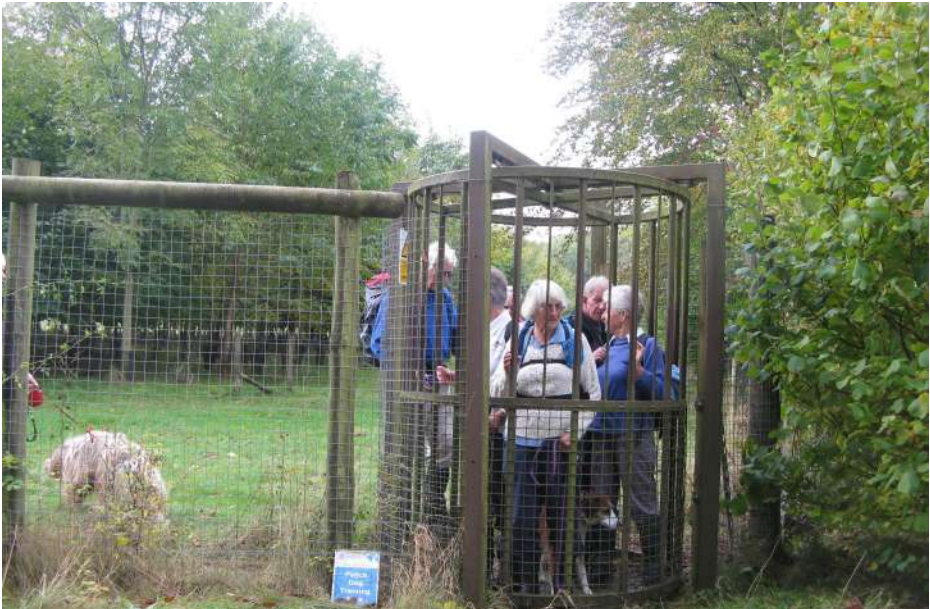
The only place of safety in the area? (look at the notice!)