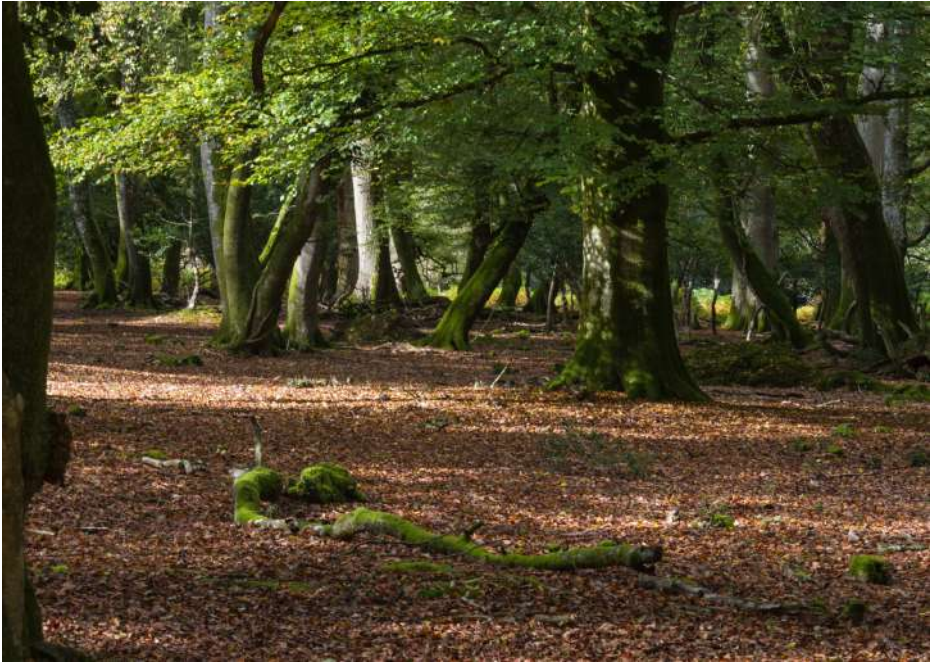
Through a beech wood