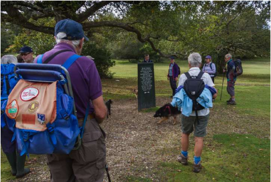
Visiting the Rufus Stone on Sunday