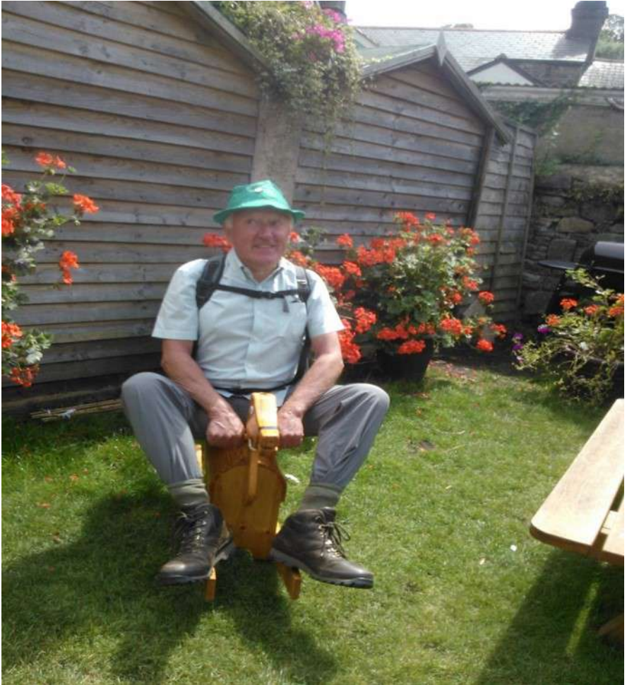
Vice Chairman at Crickhowell exploring the possibility of adding horse riding to our list of activities