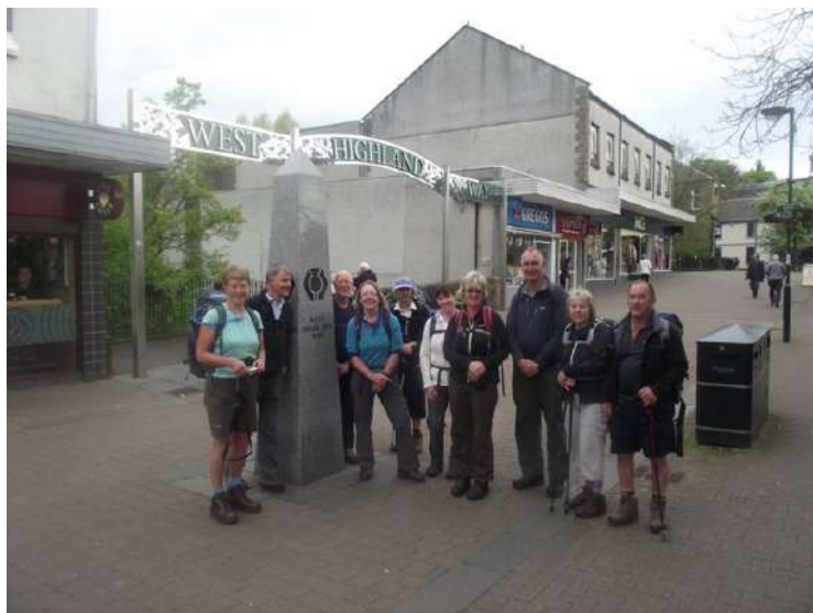
10 folks starting the West Highland Way - spot the 6 MAS members