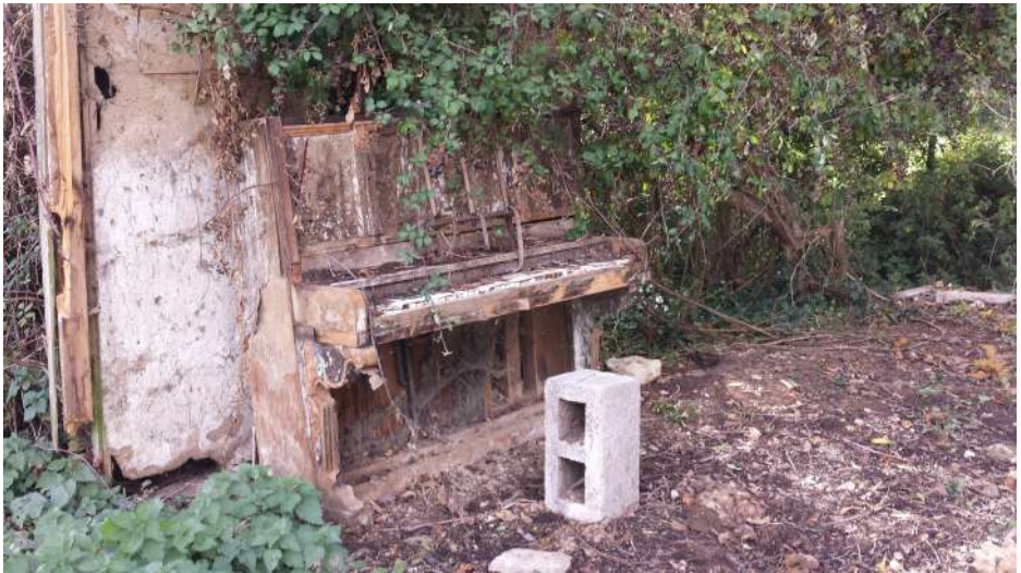
Would someone like to give us a tune?