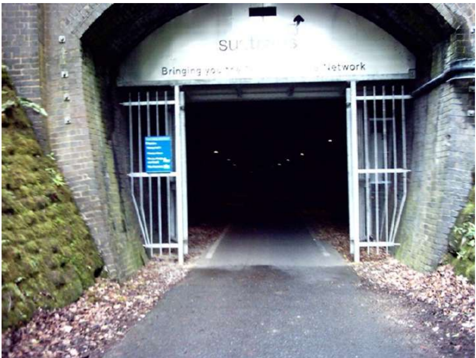
One of the tunnel entrances. Note that it is part of the Sustrans network.