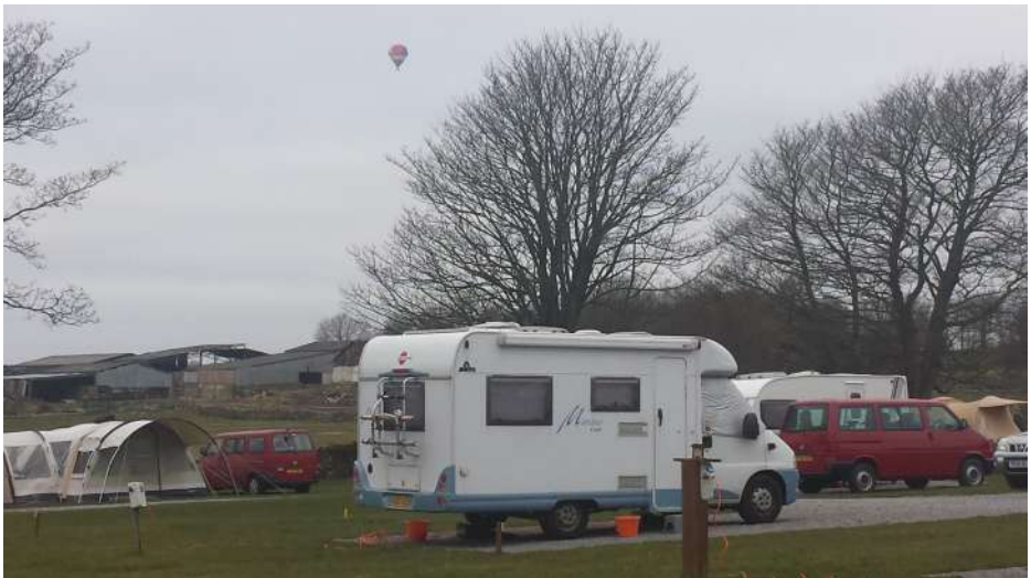
A hot air balloon taking advantage of the good weather