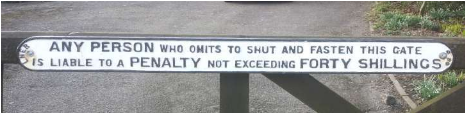
A timely but old fashioned warning!