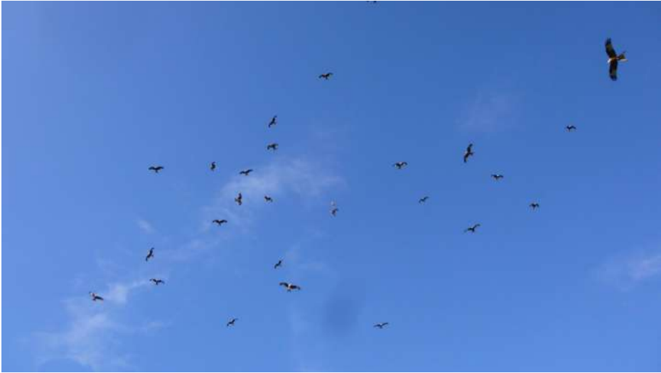
A cloud of kites