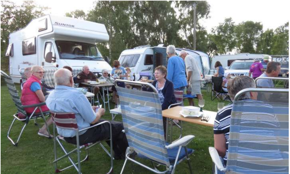
A general shot of the meet at Cannock.