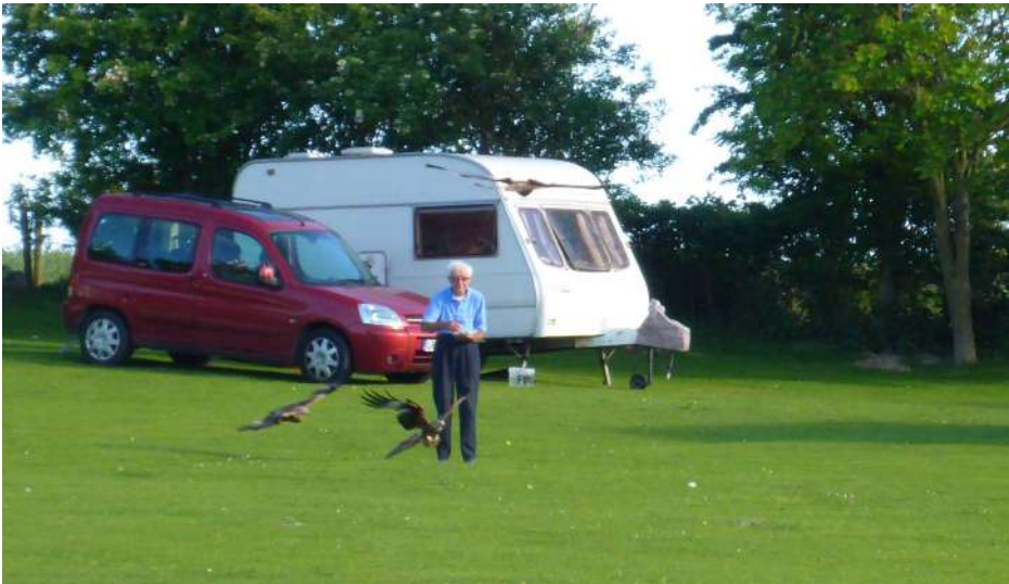
Back for seconds