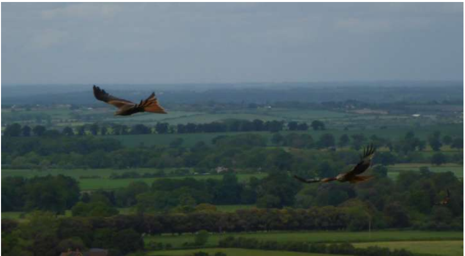
In their element