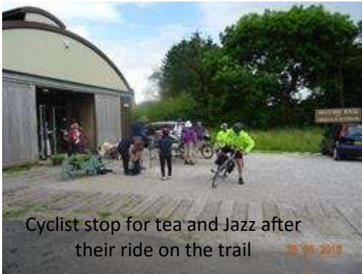
Cyclist stop for tea and Jazz after their ride on the trail