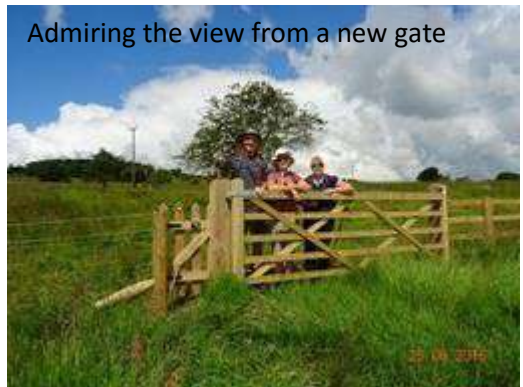
Admiring the view from a new gate