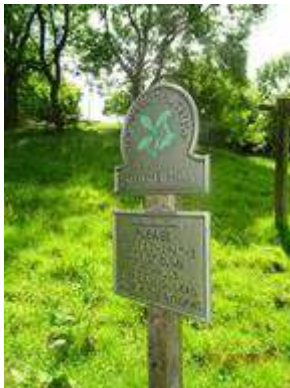
Make full use of the National Trust land in the area