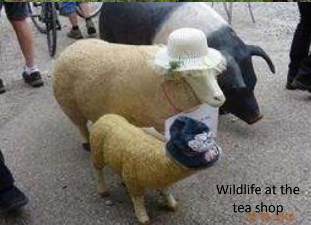
Wildlife at the tea shop