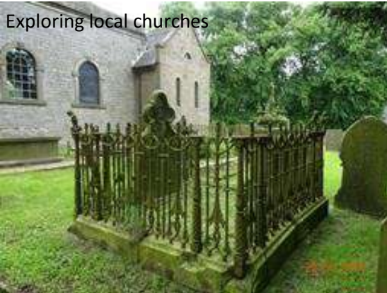
Exploring local churches

This is a small village at the end of the disused Manifold Railway offering excellent cycling and walking in the Derbyshire White Peaks.