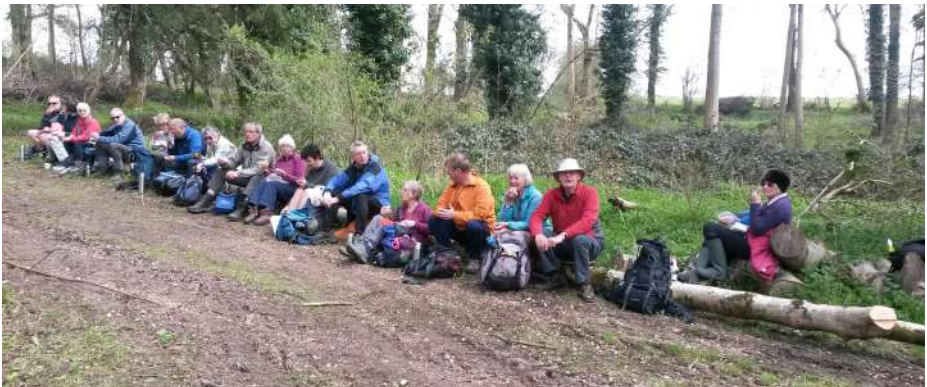
Lunch on a log

The AGM in the village hall was well attended (78 members) and the business sorted fairly swiftly. The following American Supper appeared to be