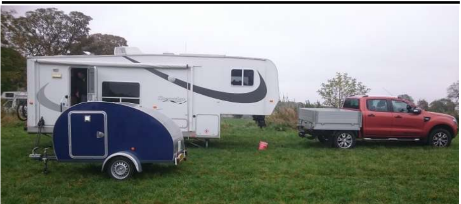
How big is yours? Massive and small, seen at Ashover.