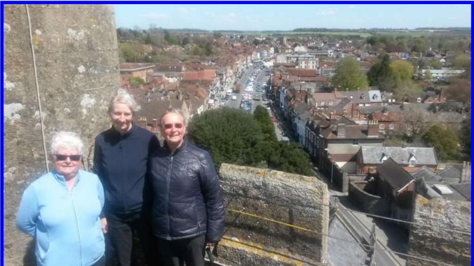
Us walker get to all sorts of places. These three Wessex ladies are pictured at the top of Marlborough church.