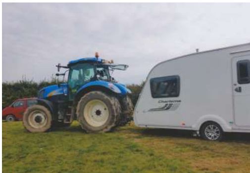
Steyning, Sussex. A few anxious moments until the ultimate tow-car extracted the van from the clay.

So the years have passed, weekend meets, THSs, Continental Rallies, we use our van to go there, and if we can't take the van we don't go!