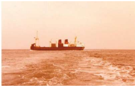
Steamer to Rum via Skye