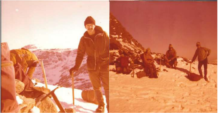
On the Glyders (North Wales) in the winter snow