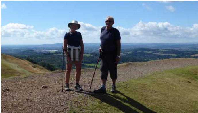
The weather and the views were magnificent