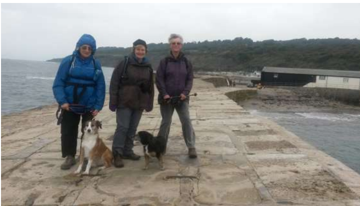
In the footsteps of The French Lieutenant's Woman ,