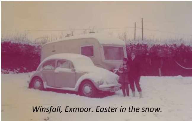
Winsfall, Exmoor. Easter in the snow.