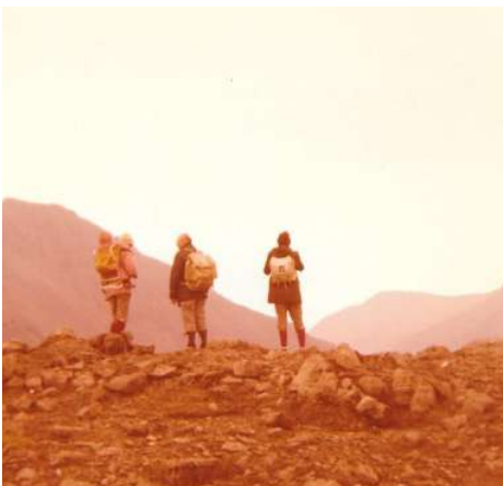
Halt during one of our walks on Rum