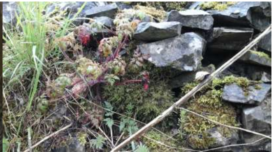
Close-up of scenery on a wall. Note the snail!