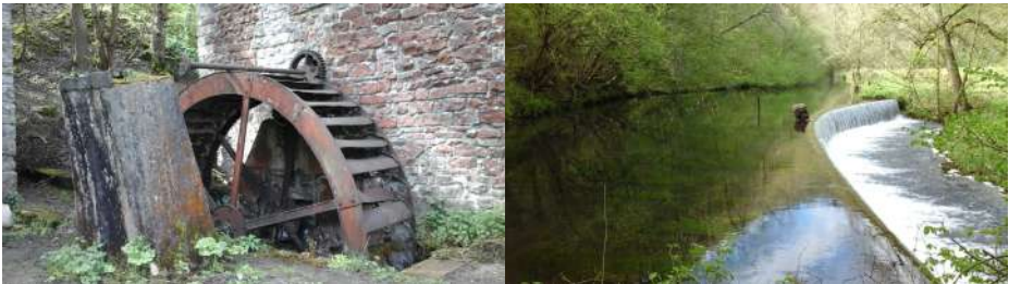
An old mill wheel and the weir from which it was once fed