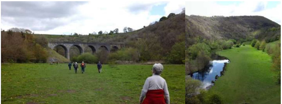
Approaching Monsal viaduct, and the view from above the viaduct