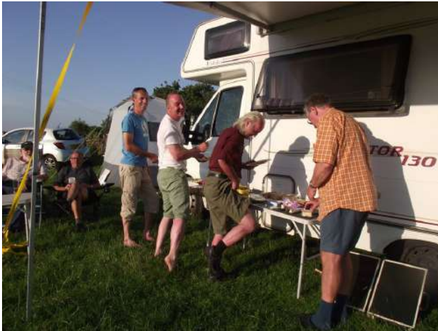
Peakland Great Get Together – reminiscent of the queue at the Job Centre in the film 'The Full Monty' – but this was for food!