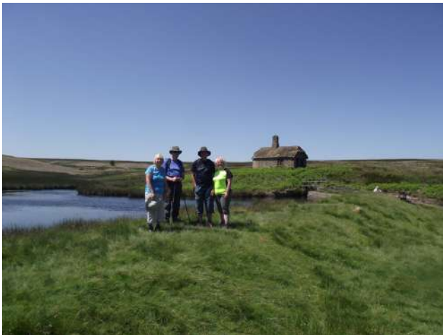
Reservoir and old building near Oaking Clough – just after Colin led us over Access Land. Great walk and weather.