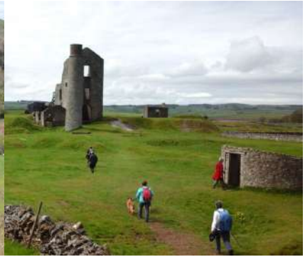
Approaching Magpie Mine