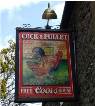
A Pub sign which gave rise to conversation. It sold nice beer, too.