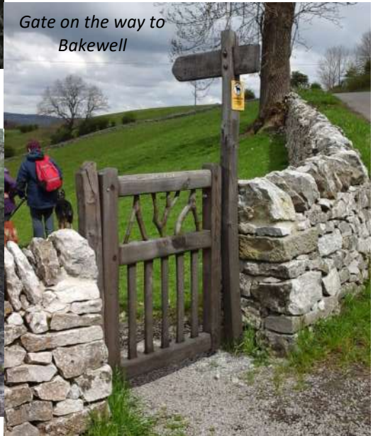
Gate on the way to Bakewell