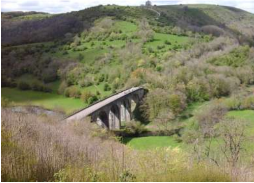
The viaduct from further above