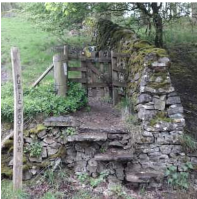
Stone steps and stile