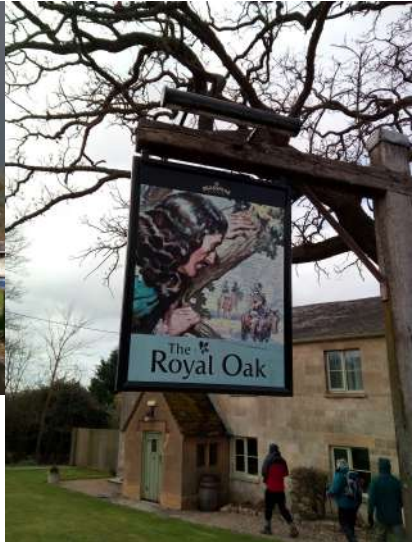
One of the many across the country