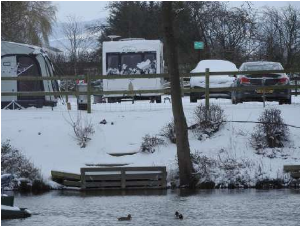
The view across the lake at Winchcombe.