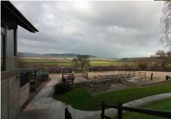
The lake without the snow