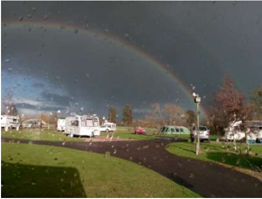
Looking for a pot of gold