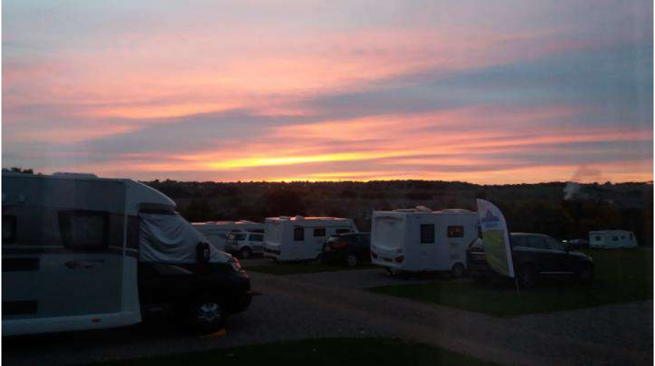
Salisbury Club site.

Wessex Area's final meet of the year was held at Salisbury Club Site. 25 units attending; most were walkers including a new couple who drove 5 hrs from Carmarthen Wales to join us for the very wet Saturday 7 miler then returning to home Sunday morning. As usual, we were blessed with 2 tandem and single cyclists. An early evening walk to the local Harvester for a conclusion meal on the Monday evening.