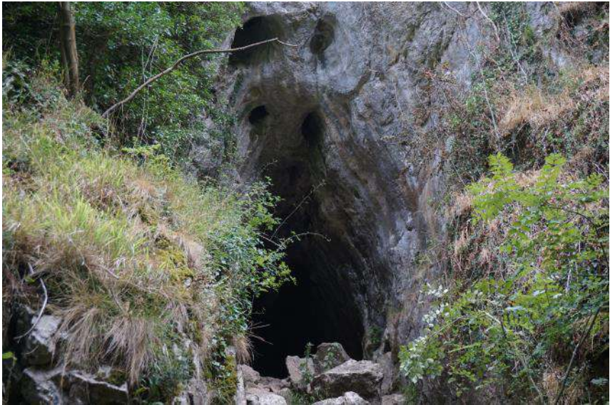
Cave entrance in Dovedale with MAS Peakland at Thorpe in July.