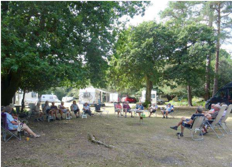
Tea and cakes under the oak.

Although we have been to the Forest many times, Ocknell was new to us, and we were pleasantly surprised. This Camping in the Forest site is on the remnants of an old airfield, much of which has been dug up and returned to nature, but there are still a few of the original dispersal pans in the site and these are put to good use as a massive area of hard standing. Added to this is an even greater area of grass for softer pitches, and a good few pitches in the trees and bushes around the edge of the site. There is no mains power available, but the toilet blocks are to a high standard. The Rally Field is off to one side not far from the entrance and is capable of holding at least 25 units. It has gravel hard parts and grassy pitches, with loads of trees all around and one particularly useful big old oak which provided shade for the post walk afternoon tea and cakes.