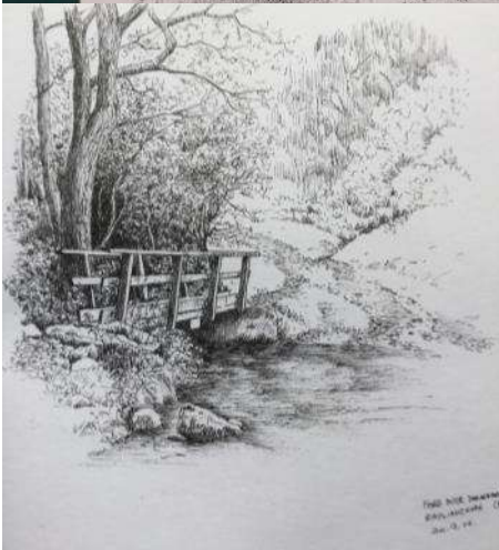
Top: Sketches from the 2017 Festival of Walking at Ashford in the Water — Mary Buckle (was Green)