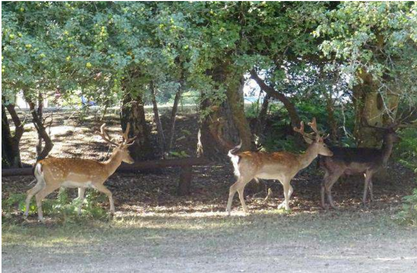
Deer wandering around the edge of our field.

We had about 21 units, so the field was well used. There were walks and cycle rides every day, but as the temperature was fairly high the walks tended to be either short, or with plenty of time in the trees for the shade. During the weekend we did two five mile walks (one of which turned out to be nearer seven!) and a visit to Furzey Gardens, and on one of the evenings we walked to the Sir Walter Tyrell pub about a mile and a half away for a cooling beer. One of the nicer events was the ice-cream van that called round every evening.