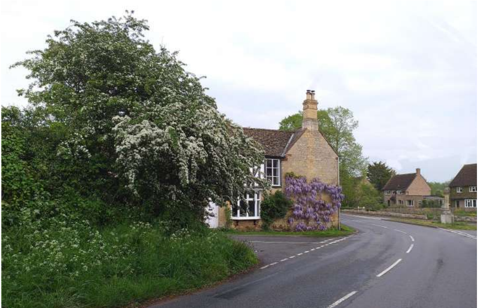
A view seen by everyone on the way out of the site at Beckford during the AGM weekend.