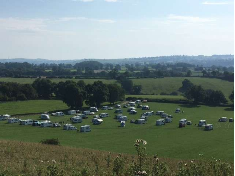
Aerial view of Peakland Thorpe meeting from Sally and Brass