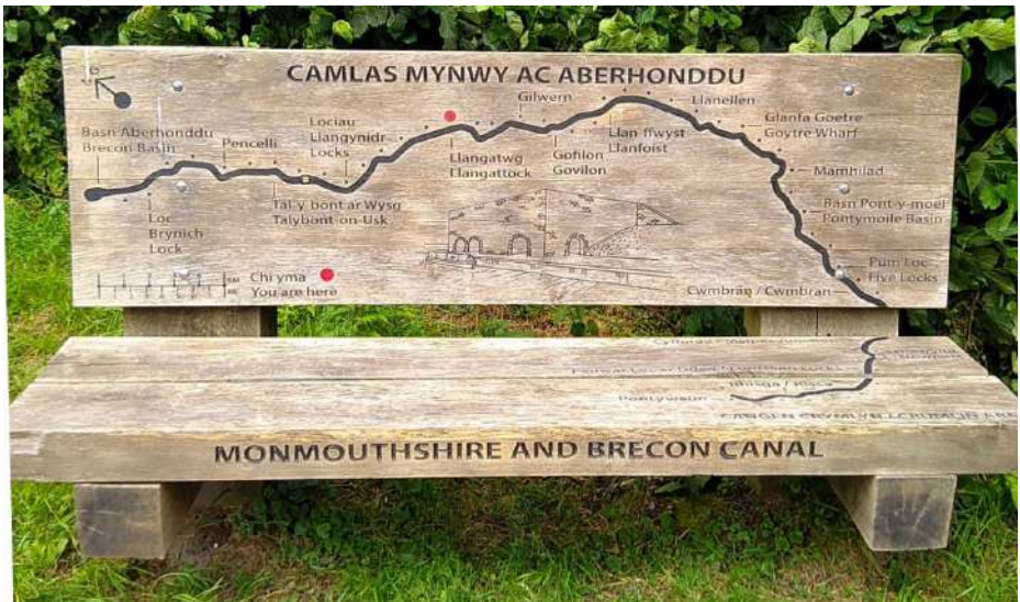
Map of a flattish walk at Crickhowell. Judith Vince