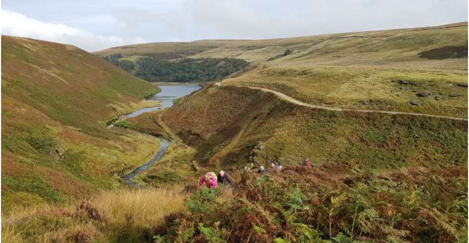
A few shots from the Peakland meet at Marsden N R Grayson