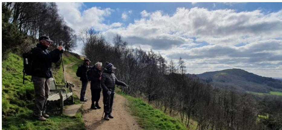
A picture from our visit to the Malverns earlier this year