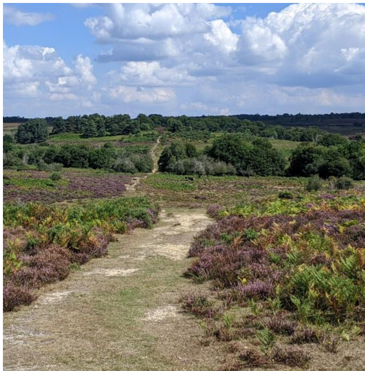
Heathland and woodland in the New Forest.