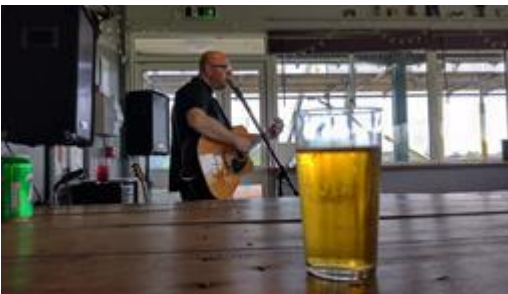
Music and cider in The Penny Tap.

response to the closure of the pub was to create The Penny Tap, a small bar in the cricket pavilion (with fairly short opening hours!), which several of us visited and enjoyed.