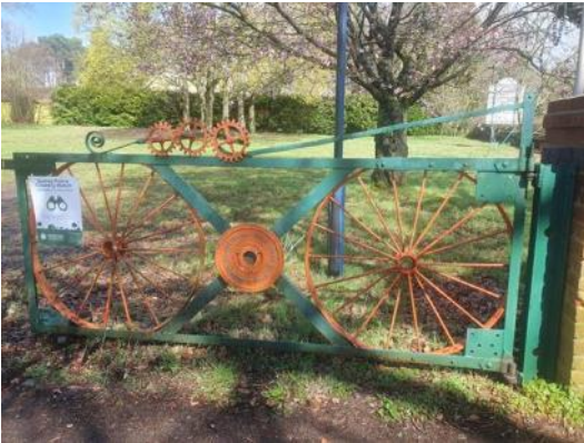
What a lovely gate