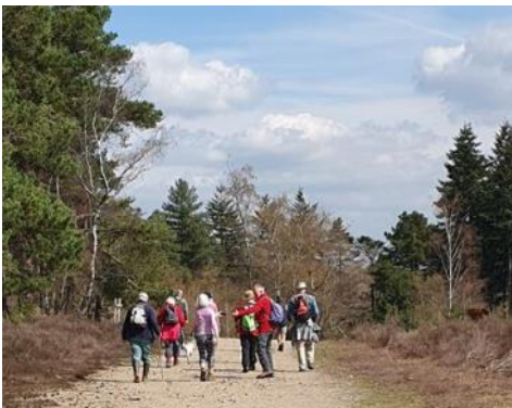
Typical walk scenery

worked hard with their “magic” ladder mats to move it out of the entrance.