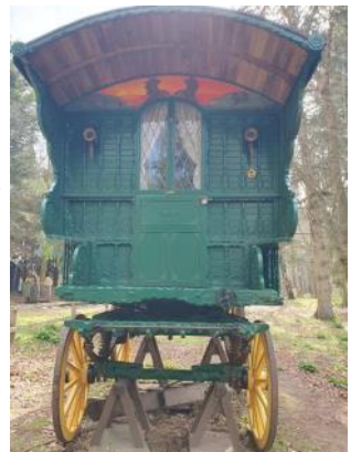
In the museum

Museum’s 50 th Founders Day and the entrance fee was 20p per adult/10p per child as that was the fee 50 years ago – a real result as today’s price is £10.75. Most of us had a good wander around the extensive site which is very well laid out with lots of huts to go in and out of, all containing well laid out memorabilia, a Polish refugee’s hut, Anderson shelter, pre-fab bungalow plus 2 magnificent working steam