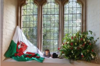
Welsh Flower Arrangement

There was also a concert (Simply Cecilia) in the church next to the site on