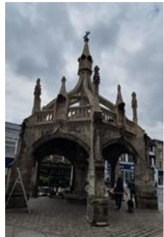
Market Cross in Salisbury

and routes for self-guided walks and rides were also available, and those who wanted to do their own thing got on with it. Access to the footpath network from the site is very good, and the walks varied from relatively flat to having a good few hills. Almost all of them went through a bluebell wood at some stage, and the green of early crops growing, the yellow of the oil seed rape and the blue of the woods provided a feast for the eyes. There were hares to see rushing across some of the fields and deer were spotted on several occasions.