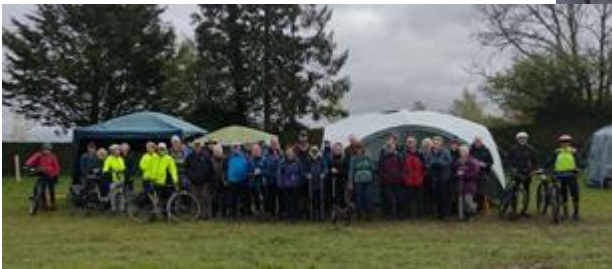
Walkers and cyclists ready to go

There were four walks with leaders organised each day, varying from 6½ to 12 ¼ miles, and two cycle rides. Maps