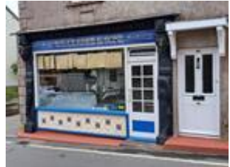
The butcher's shop

facilities due to the COVID lockdown and general progress over the years—there is no longer a pub, and the two tearooms have closed down. Fortunately the mini Budgens shop at the bottom of the village is still open and seems to be doing well, and the butcher’s shop is also thriving. The village has exceedingly good outdoor facilities—a spacious children’s playground, a football field and a cricket field, the village hall and the cricket pavilion. The locals’