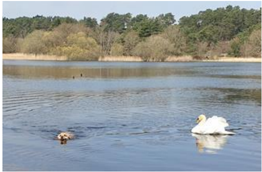
Dog and swan in the pond