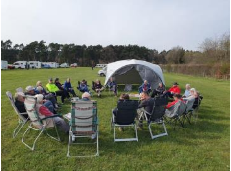
The shelter at tea-time

Our field was right next door to the Rural Life Living Museum, of which more later. It was a cold weekend with variable weather (frost, heavy rain, strong wind, fog, thunder, sun....but this is England!). Putting the large group shelter up was fun: we'd got the poles sorted out and had just got the top on when there was a torrential downpour with water gushing off the top, which we were all huddled under! The field entrance got rather muddy, catching out a twin axle motorhome but Debs & Trevor