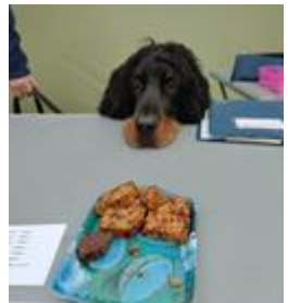
Chester hoping to share the team's cake!

The AGM was held on Saturday evening in the Village Hall (a whole 200