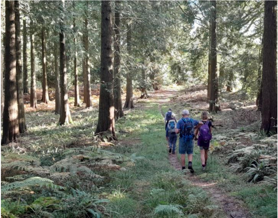
Walking through the northern edge of the New Forest on a wet Autumn day

The newsletter for the Walking and Cycling Section of the Camping and Caravanning Club