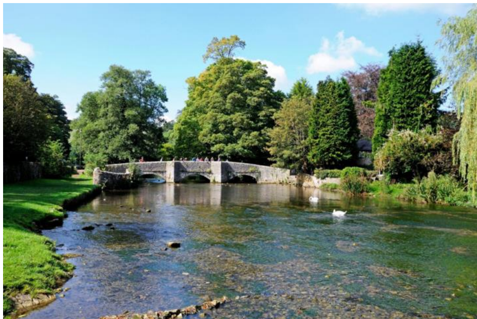
The Sheepwash Bridge (above) is a much photographed bridge in the country.

What's not to like? Come and join us for a great meet or as they said in the 60's – be there or be square!